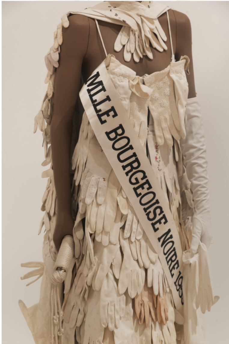
In the early '80s, Lorraine O'Grady attended openings as the character Mlle Bourgeoise Noire , wearing a dress of white gloves, a sash, and a white cat o' nine tails.

ARTnews: Lorraine, you've written some pretty amazing performance scripts, though, particularly for your character Mlle Bourgeoise Noire , who invaded art openings wearing a dress made of white gloves and held forth about Blackness and class. How did you come up with her?