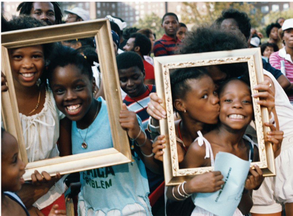
Art Is... (Girlfriends Times Two) is part of a photographic series documenting O'Grady's participation in the 1983 African American Day Parade in New York. O'Grady and her assistants invited attendees to pose in gilded picture frames.

In February, O'Grady and Fraser joined ARTnews for a Zoom conversation focused on the limits of institutional critique and the continued importance of activism in the art world.