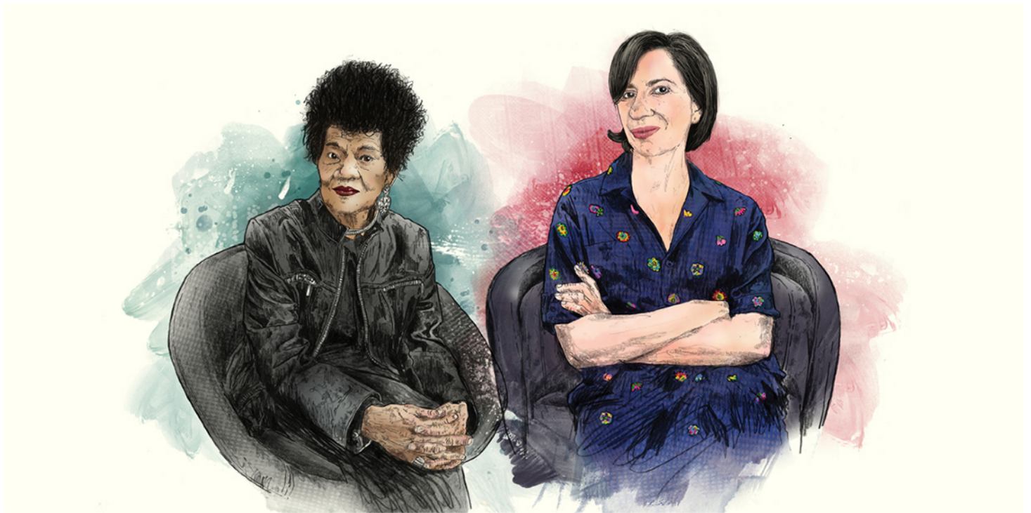
Lorraine O'Grady, left, and Andrea Fraser.