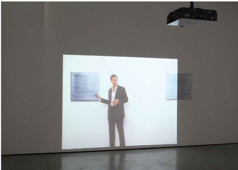
In her performances, Andrea Fraser has inhabited numerous personas that she thinks of as “not-me containers.” In Art Must Hang (2001), she reenacts a drunken tirade by German artist Martin Kippenberger.

O’Grady: We are probably always doing somebody else’s job, right?