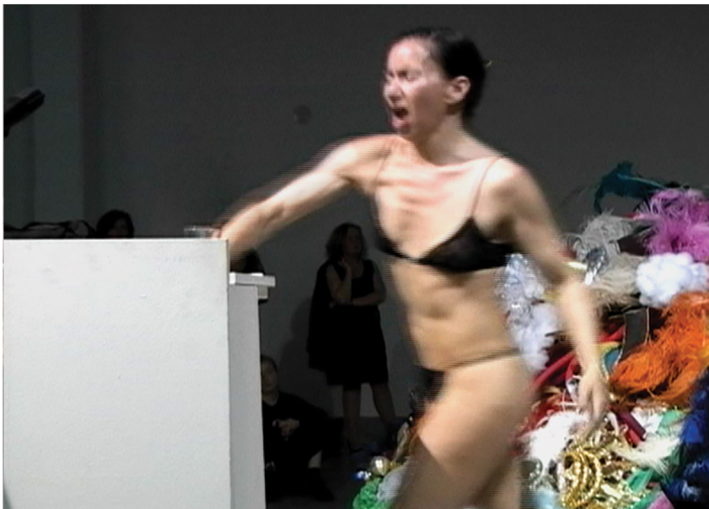
In her 2003 performance Official Welcome, Andrea Fraser undressed and announced, "I'm not a person today. I'm an object in an artwork."